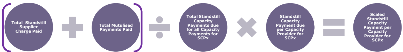
Figure 3 - Methodology to Calculate the Scaled Standstill CM Capacity Payment

This Supplementary Mutualisation will take account of any late payments received for Standstill Supplier Charge, Standstill Mutualisation and any related Late Payment Interest, since the Standstill Capacity Payment scaling occurred. Following any Supplementary Mutualisation, Standstill Residual Capacity Payments for that SCP x will be made (see section 12).